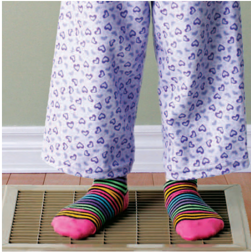
Natural gas heat is 20-40 degrees warmer than heat from an electric heat pump.